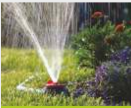
Gardening and small farm irrigation