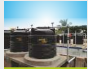
Water supply to overhead tanks