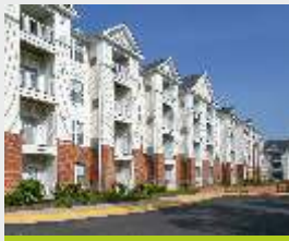
Domestic and community water supply